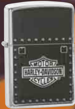
24168 H-D® Saddle Bag Emblem Brushed Chrome