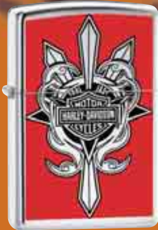
24393 H-D® Black High Polish Chrome