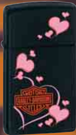
24395 H-D® Floating Hearts Slim Black Matte