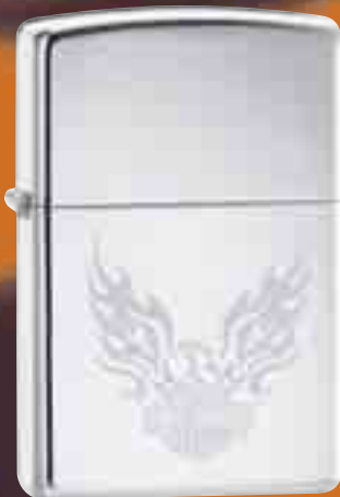
21057 H-D® Eagle High Polish Chrome