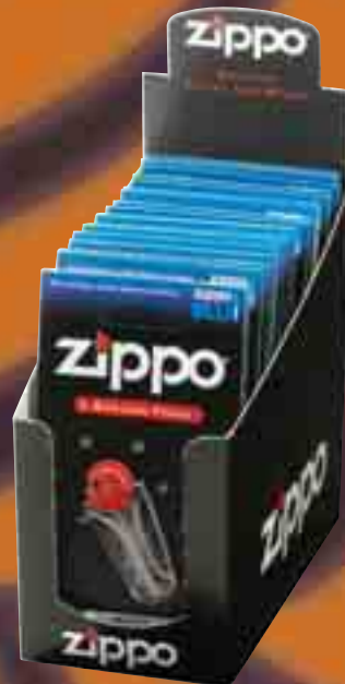
2406N Flint Cards - 24 cards per display box; 24 boxes per master carton