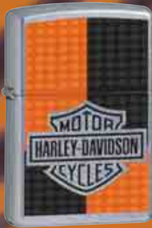
24030 H-D® Deco Street Chrome