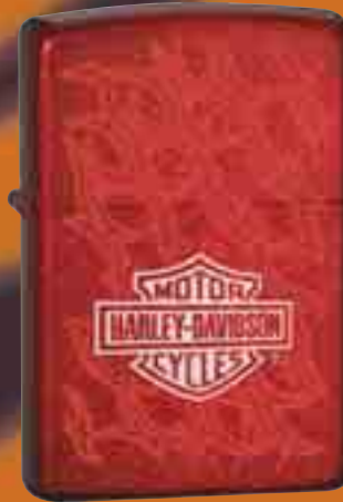
24022 H-D® Barbed Wire Facade Candy Apple Red