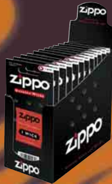
2425 Wick Cards - 24 cards per display box; 24 boxes per master carton