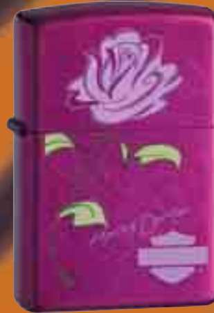
24166 Harley-Davidson® Rose Candy Raspberry