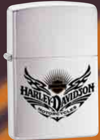
24293 Harley-Davidson® Motor Brushed Chrome