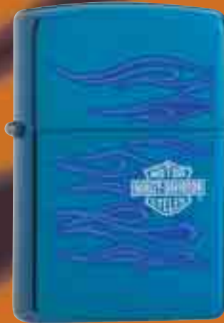
20711 Harley-Davidson® Ghost Sapphire