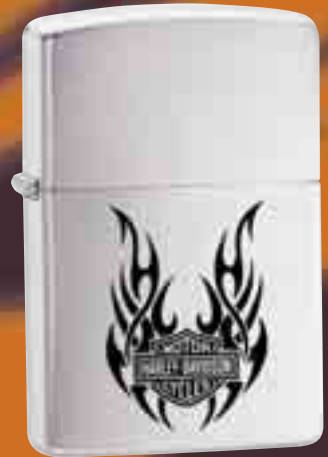
21046 H-D® Tribal Wings Brushed Chrome