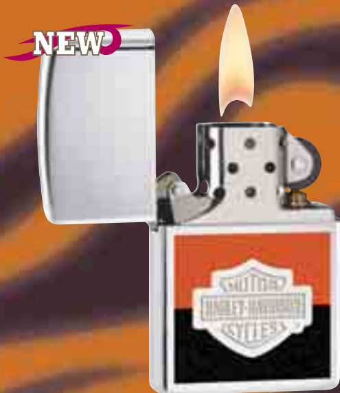
24507 Harley-Davidson® High Polish Chrome