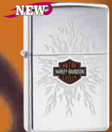
24504 Harley-Davidson® High Polish Chrome

A dual process consisting of Surface Imprint and Auto Engrave is used to create these unique designs.