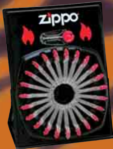
2406C Six Flint Dispenser - 24 per Display Card