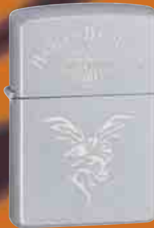
21047 Harley-Davidson® Eagle With Attitude Satin Chrome