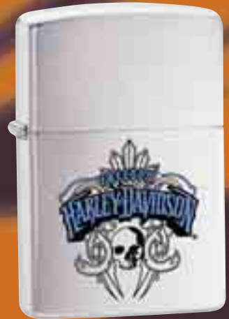
24394 H-D® Freedom Brushed Chrome