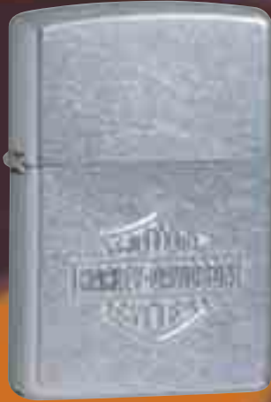
24002 H-D® Bar & Shield Stamp Street Chrome

The Bar & Shield logo is stamped from the inside of this lighter, resulting in an enduring embossed look and feel.