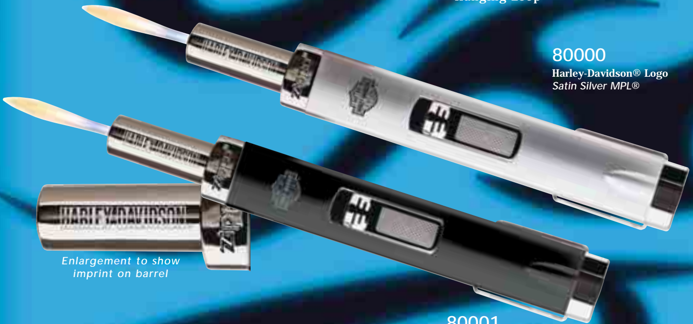
80000 Harley-Davidson® Logo Satin Silver MPL®