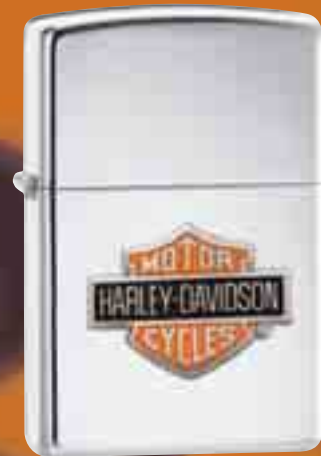
24021 H-D® Bar & Shield Emblem High Polish Chrome