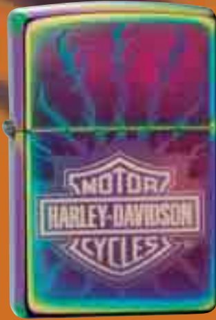
24031 H-D® Flaming Barbed Wire Spectrum