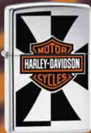
24024 H-D® Reflection High Polish Chrome