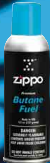
3800 Butane Fuel 4.5 oz. (127 grams) Shipping carton of 48 with 8 innerpacks of 6