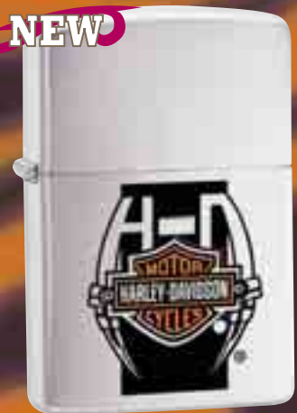
24505 Harley-Davidson® Brushed Chrome