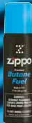
3801 Butane Fuel 1.9 oz. (54 grams) Shipping carton of 48 with 8 innerpacks of 6