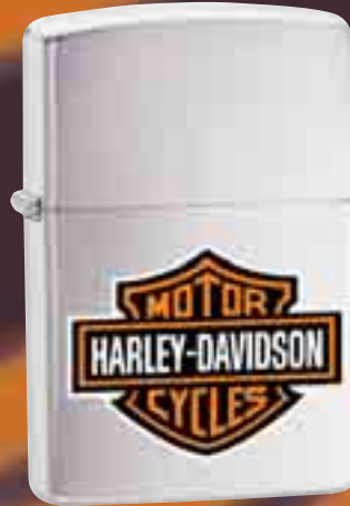
200HD.H252 H-D® Logo Brushed Chrome

The Bar & Shield logo is stamped from the inside of this lighter, resulting in an enduring embossed look and feel.