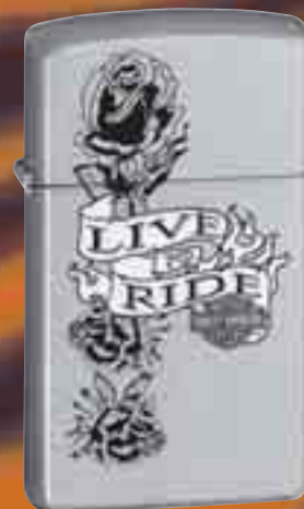
24008 H-D® Live To Ride Slim Satin Chrome

Sleek and sassy, these slim lighters have all the features of a full-size Zippo windproof lighter, in a trim, compact size.