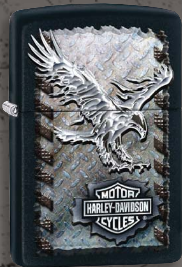
28485 Black Matte Color Image