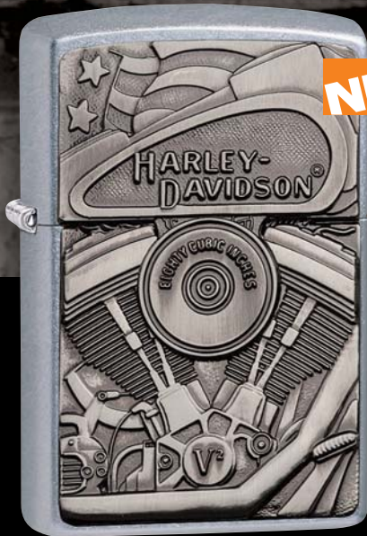
29266 Street Chrome Emblem Attached