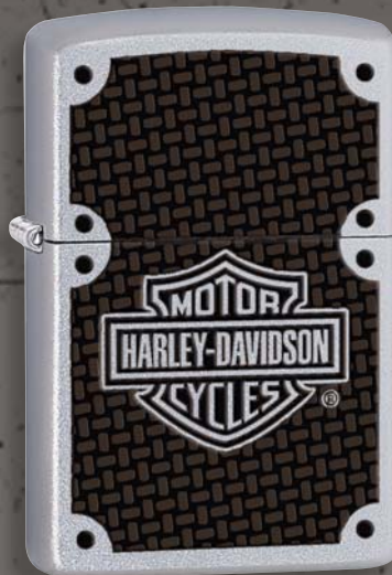
24025 Satin Chrome Color Image