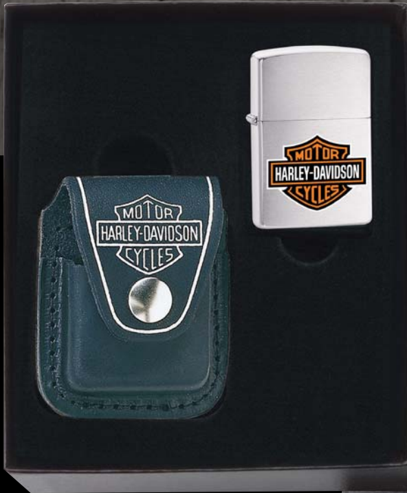
HDP6 H-D® Lighter Pouch Gift Set

Lighter Pouch Gift Set includes black leather pouch in a handsome gift box. Add any lighter to create a custom gift set. (Lighter not included.)