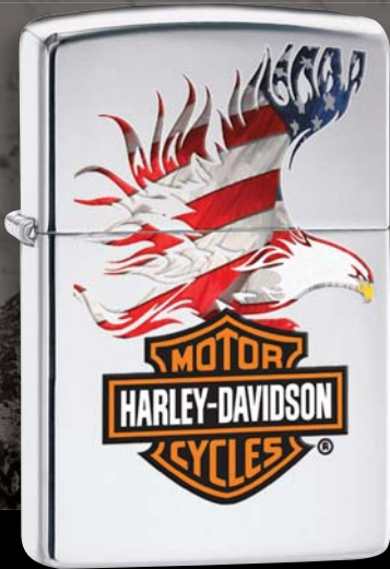
28082 High Polish Chrome Color Image