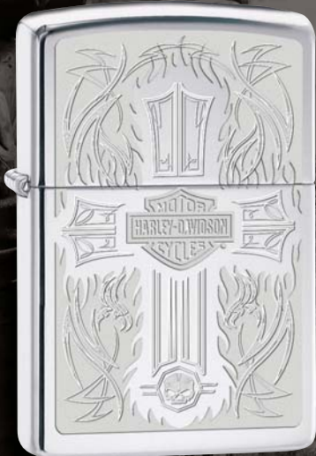
28982 High Polish Chrome Laser Engrave / Auto Engrave