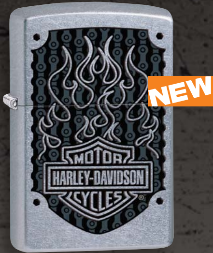
29157 Street Chrome Color Image