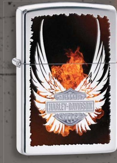
28824 High Polish Chrome Color Image