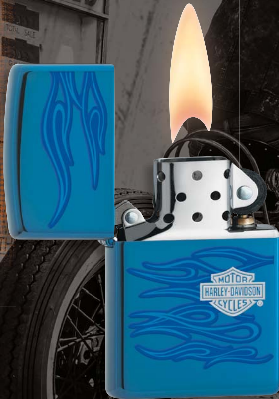
20711 Sapphire Color Image