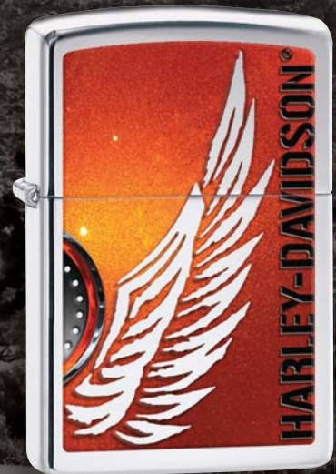
28977 High Polish Chrome Color Image