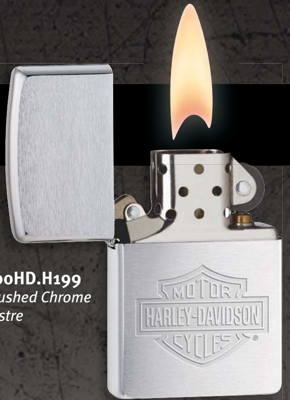
200HD.H199 Brushed Chrome Lustre