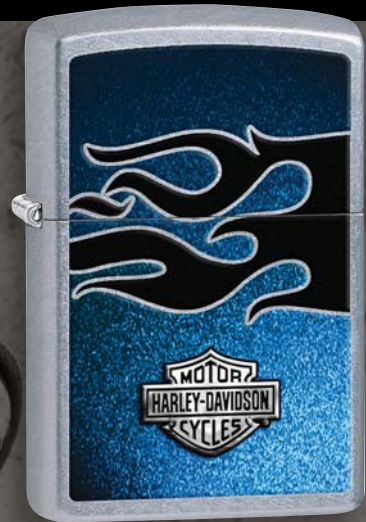
28822 Street Chrome Color Image