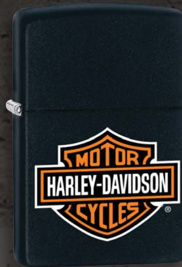
218HD.H252 Black Matte Color Image