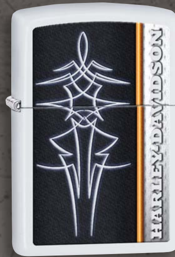
28978 White Matte Color Image