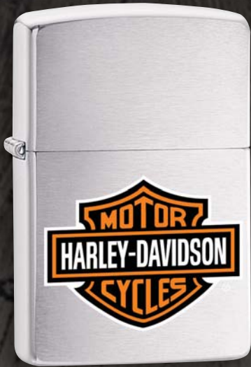
200HD.H252 Brushed Chrome Color Image