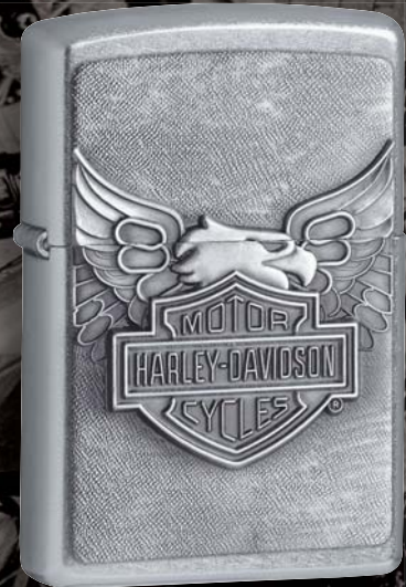
20230 Street Chrome Emblem Attached