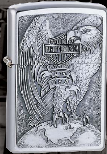
200HD.H231 Brushed Chrome Emblem Attached