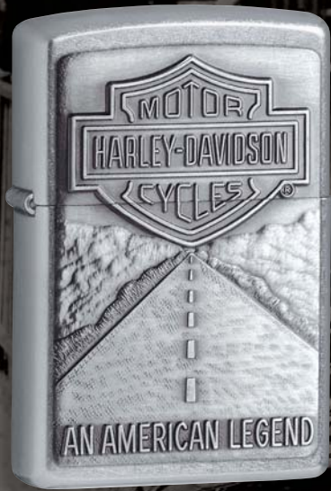
20229 Street Chrome Emblem Attached