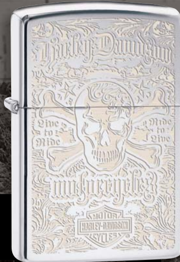
28229 High Polish Chrome Laser Engrave